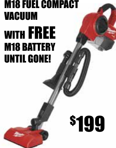
WITH FREE M18 BATTERY UNTIL GONE!