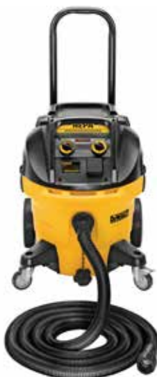
DEWALT DUST EXTRACTORS, 10 GAL, INCLUDES ANTI-STATIC HOSE AND HEPA FILTERS