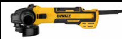
DWE43231VS 5" GRINDER 5 IN. BRUSHLESS VARIABLE SPEED SLIDE SWITCH SMALL ANGLE GRINDER WITH KICKBACK BRAKE AND PIPELINE COVER