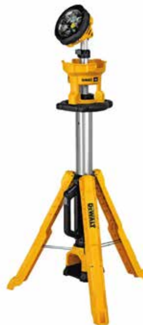
DCL079B 20V TRIPOD LIGHT TOOL ONLY