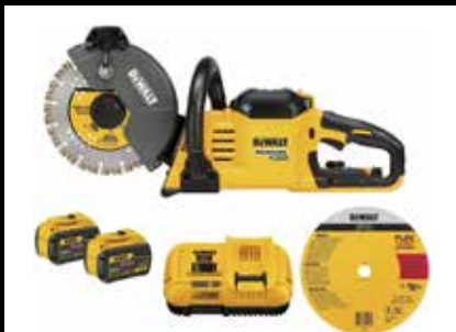
DCS690X2 FLEXVOLT 60V MAX 9" CUT-OFF SAW KIT