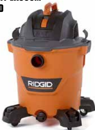
RIDGID HD1200 12 GALLON NXT WET/DRY VACUUM CORDED