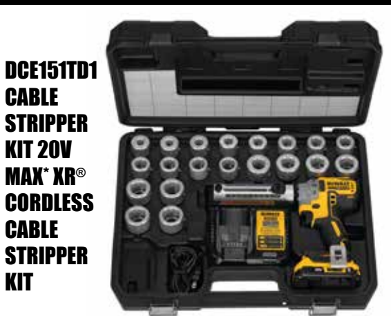
DCE151TD1 CABLE STRIPPER KIT 20V MAX* XR® CORDLESS CABLE STRIPPER KIT