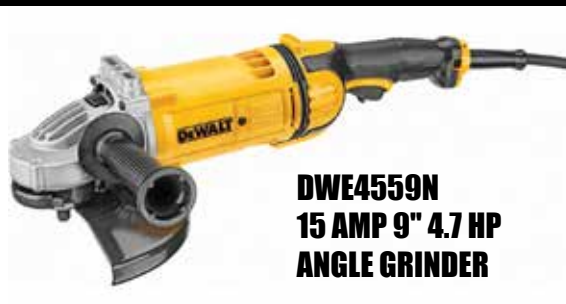
DWE4559N 15 AMP 9" 4.7 HP ANGLE GRINDER