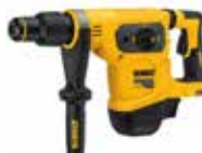
1-9/16" CORDLESS COMB. HAMMER DCH481X2