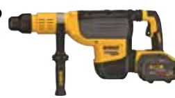
2" CORDLESS SDS MAX COMB. HAMMER DCH773Y2