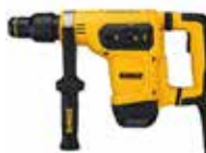
1-9/16" CORDED COMB. HAMMER D25481K