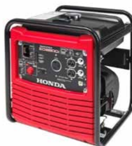
Honda EB2800 Powerful, easy-starting Honda engine Advanced inverter technology ensures stable, high-quality power. Circuit-protected outlets. Quiet 61—69 dB operation. Up to 12-hour run time on 2.1 gal. fuel. Full frame protection. Oil Alert® shuts off engine. Fuel gauge.