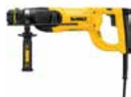
1-1/8" SDS+ CORDED D25263K

BATTERY OPERATED HAMMER DRILLS WITH THE SAME AMOUNT OF POWER AND TORQUE AS THEIR CORDED VERSION—JUST AS HARD-HITTING (CALL HAVE CHIPPING MODE)