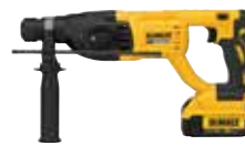
1" SDS+ CORDLESS D-HANDLE DCH133M2