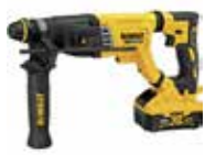
1-1/8" SDS+ CORDLESS DCH263