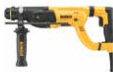
1" SDS+ CORDED D-HANDLE D25262K