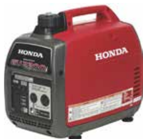
Honda EU2200i Inverter Generator 2200 Surge Watts, Parallel Capable, CARB-Compliant.

A FEW RECENT MODELS IN OUR GROWING LINEUP OF HONDA GENERATORS: