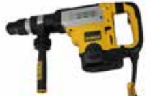
2" CORDED SDS MAX COMB. HAMMER D25773K