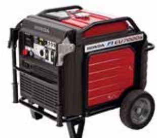
Honda EU7000IS Portable Inverter Generator 7000 Surge Watts, 5500 Rated Watts, Electric Start, CARB-Compliant, Model # EU7000IS-all the features you want. A great choice!