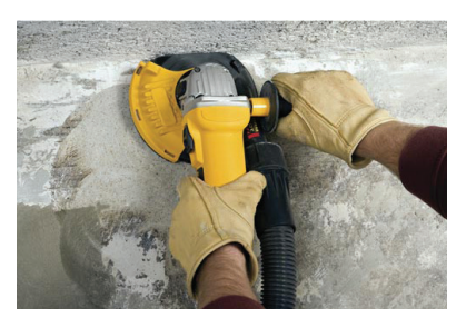
5 In. Surfacing Shroud DEWALT-DWE46152