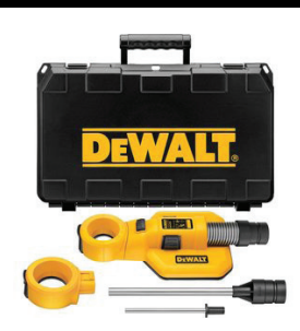
Large hammer dust extraction system